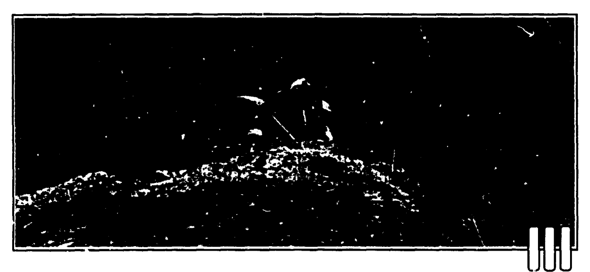
Figure A: "Bug of the Badlands"

Mark W. Tilden Biophysics Division Los Alamos National Laboratory Los Alamos, NM 87545, USA <mwtilden@lanl.gov> P: 505/667-2902 F: 505/665-5103