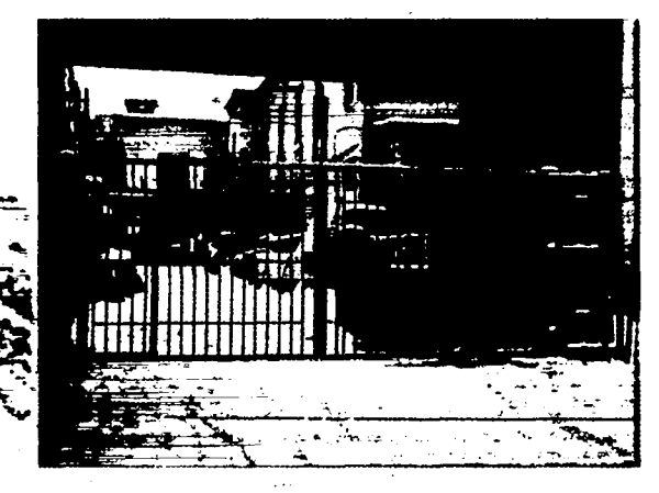
A few months later, the same building at Kurchatov is surrounded by a fence equipped with intrusion sensors and sophisticated entry and exit control equipment.

February 1995: Demonstration of MPC&A system capabilities to a wide audience of Russian and US participants.