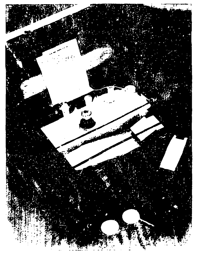
Fig. 1. Spot-test kit with reagents and filter papers. Shown also is a portable UV lamp. A test for TET and a blank with Reagent A show blue-black color on the left circle and a clear blank on the right

The inside of the case has been partitioned to hold the reagent bottles, the portable UV lamp (UVP Model G-14)* and charger, and the utensils and supplies needed for testing. The four reagent bottles are sushioned in a mold made of silicone rubber resistant to chemicals. Three test tubes are also cushioned to hold the dropper and stoppers to prevent contamination – supplies include glass droppers, a spatula, filter papers, polyethylene bags, paper towels, a grease penell, and instructions. The plastic bags are used to