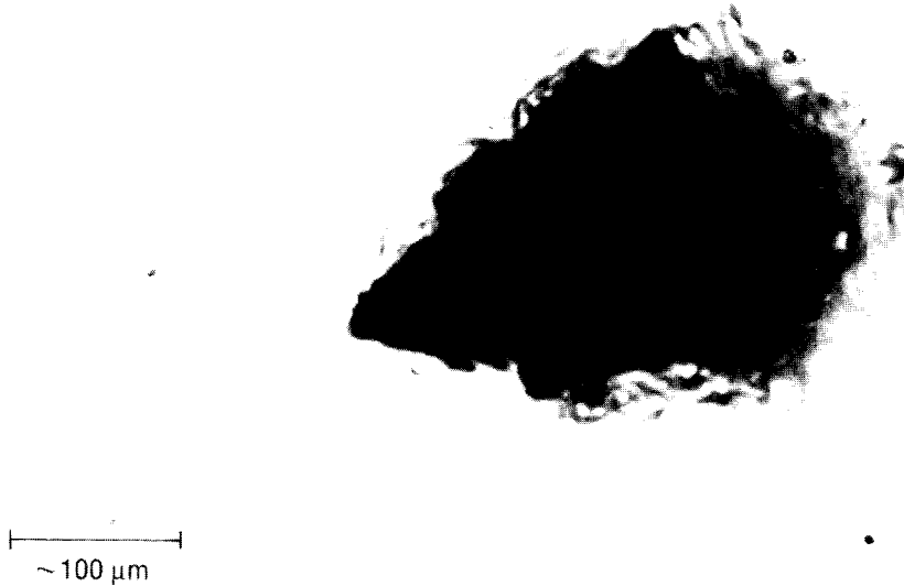
Fig. 1. Cells in culture multiply by mitosis and spread over the surface of the culture dish until a confluent monolayer of cells is formed. Shown here is an optical micrograph of a confluent monolayer of fibroblasts cultured from a piece of human skin tissue (dark area).