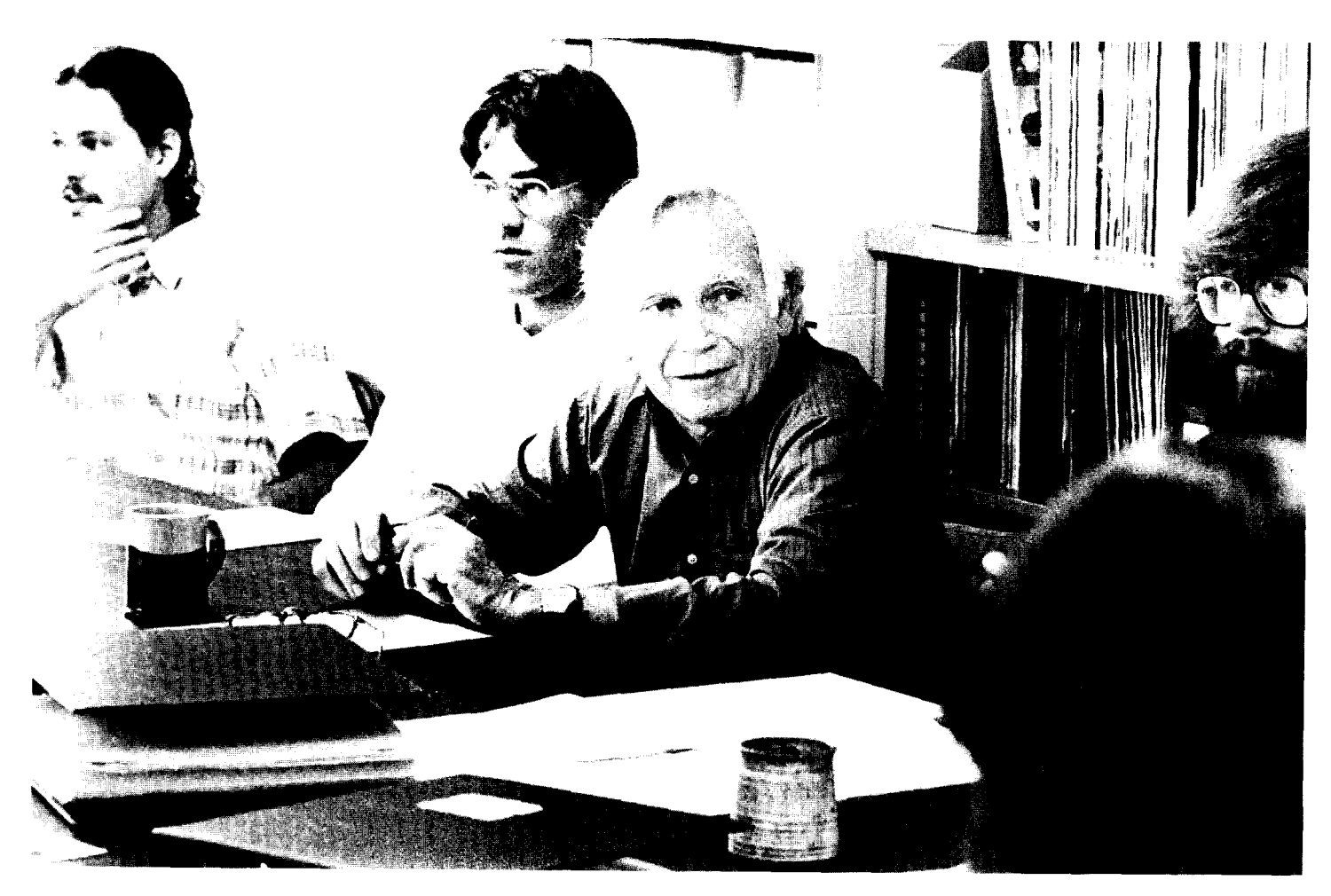
The weekly meeting of the group is a time for discussing problems about the GenBank entries.

The data bank entry for a sequence includes, in addition to the sequence itself, a name up to ten characters long that tries to speedily identify the sequence by at least suggesting species and function, the