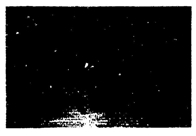
FIGURE 3n A PORTABLE INCINERATOR DEVELOPED BY LANL (IN TRANSPORT)

Industry uses temporary, flexible, portable, or modular processing systems due to economics. LANL has built transportable, temporary facilities for our customers. Figures 3a and 3b show a portable incinerator developed by the Laboratory to burn excess flares and smokes for the Navy.