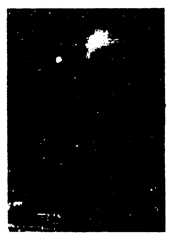
FIGURE 35 A PORTABLE INCINERATOR DEVELOPED BY LANL