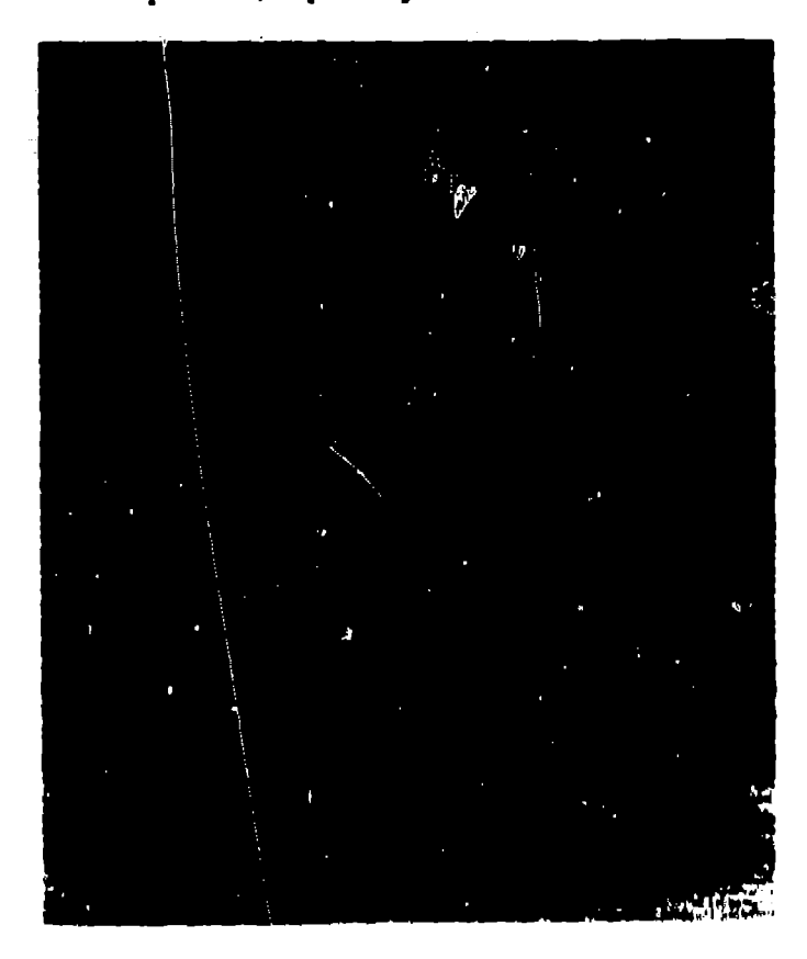
FIGURE 4 A PORTABLE SKID USED TO STABILIZE URANIUM CHIPS

The Laboratory has also built portable equipment to measure and process various radioactive materials. Figure 4 shows a portable skid used to stabilize uranium chips. Figures 5a and 5b show a stand-alone module of the glovebox process in a skid and a stand-alone module of the glovebox process in a transportainer, respectively.