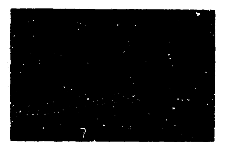
FIGURE 2a FAILED PACKAGE OF LEGACY RESIDUES