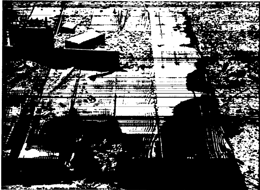
Fig. 4. Example of sporadic burning on the edge of a thick wooden platform situated 1000 ft from the center.