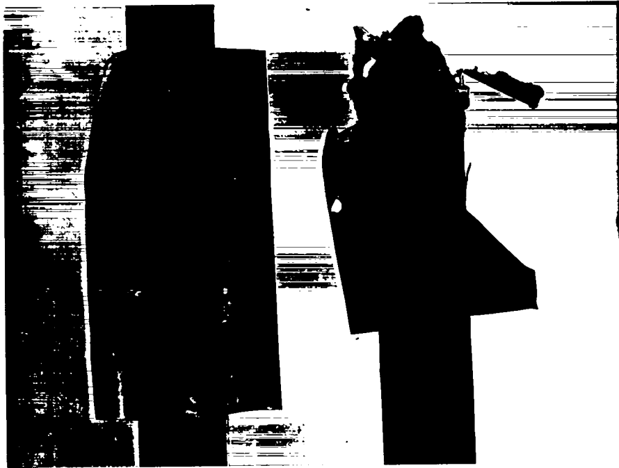
Fig. 3. Corrugated iron specimens nailed to fir lumber - specimens recovered from 3200 ft (left) and 800 ft (right).